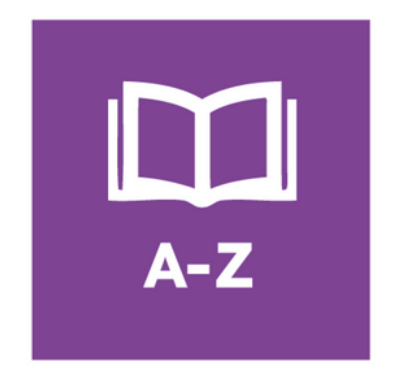
Dictionary: Highlight and click on this to view the definition of the word