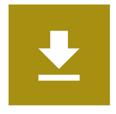
Download Audio: Highlight the text then click the button to download the text as an audio file