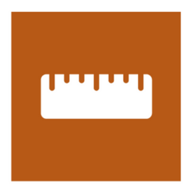
Ruler: Click to enable the reading ruler