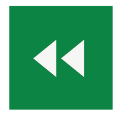
Back: Rewind to the previous paragraph of text