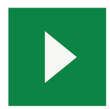
Play: Click the play button to read the text aloud