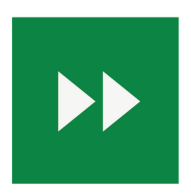
Forward: Skip forward to the next paragraph of text